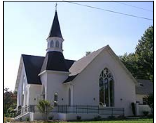
Newly renovated Chapel of the Davidson United Methodist Church